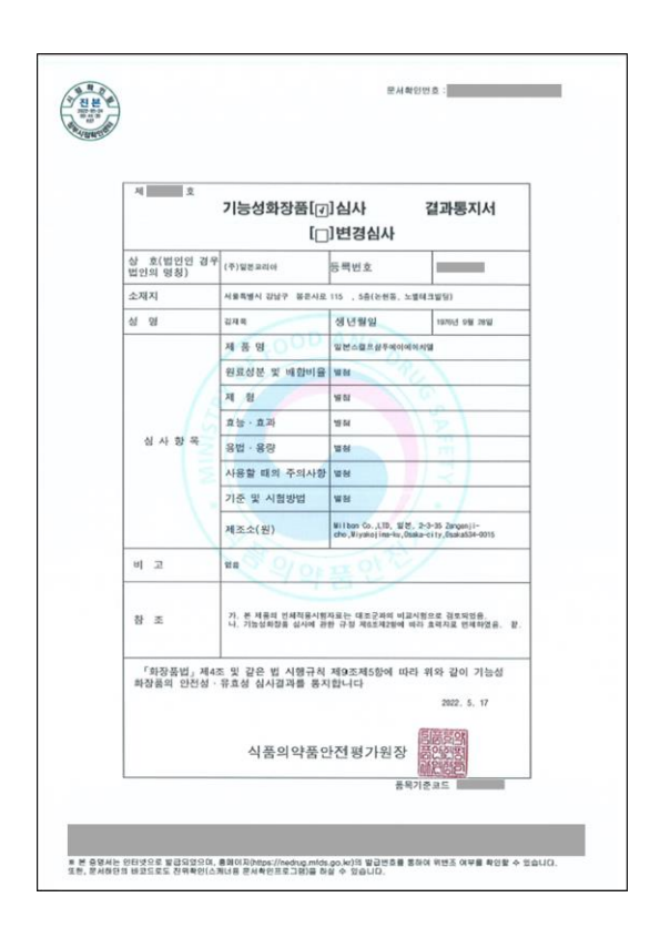
Figure 2. Notification of the MFDS functional cosmetics examination result

The group that used the shampoo formulated with three scalp care ingredients (panthenol, niacinamide, and salicylic acid) experienced a statistically significant (p<0.05) increase in the number of hairs from the 8th week onward.